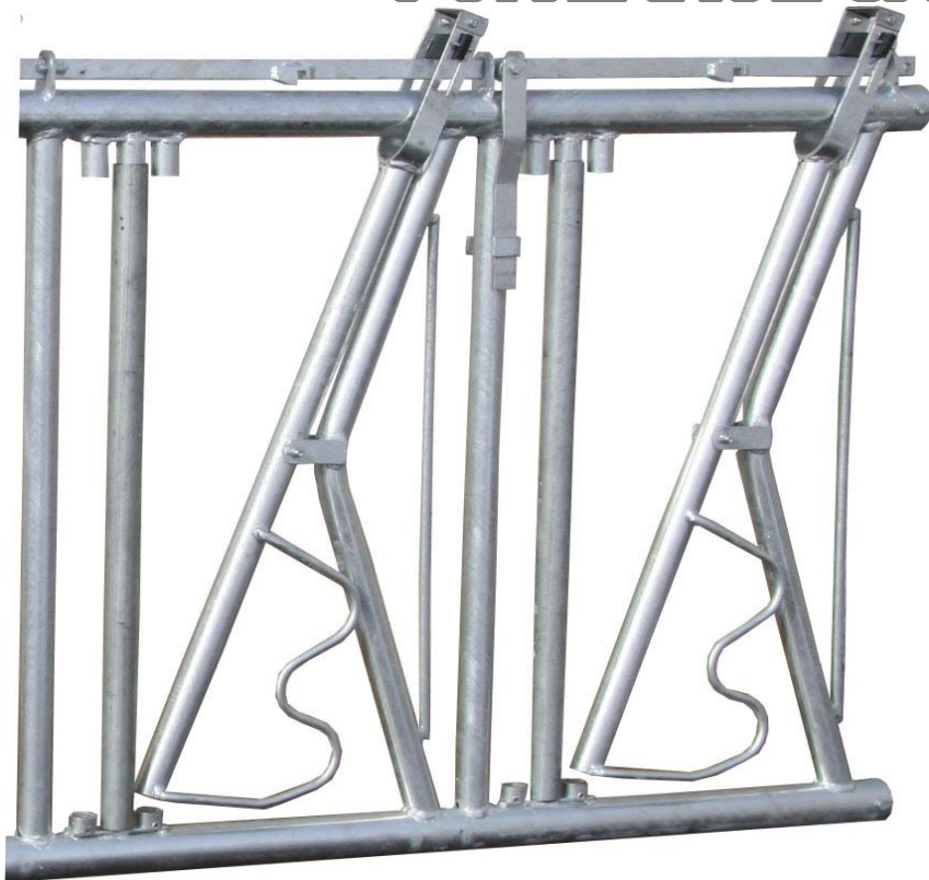
Spring Loaded Bar